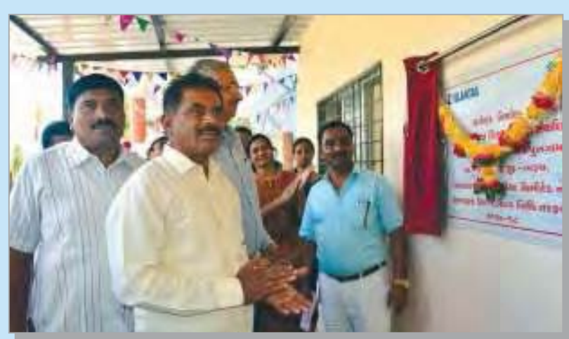
CSR Initiative: Inauguration of Pungam School in Ankleshwar area, Gujarat