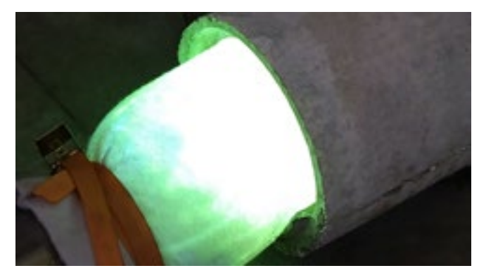
EUV 02, 1 component UV curing resin