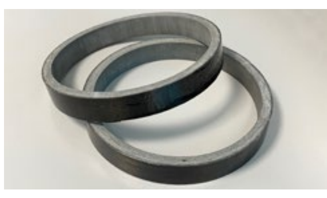
Filament Winding on fiber-concrete pipes for an outstanding chemical and mechanical resistance