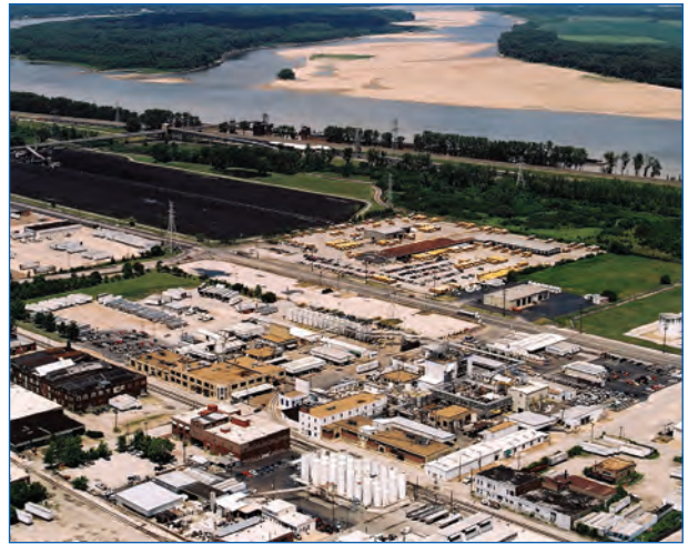
ELANTAS PDG, Inc. headquarters in St. Louis, Missouri

ELANTAS Electrical Insulation companies are strategically located throughout the world to meet the primary insulation, secondary insulation and electronic and engineering materials needs of our customers.