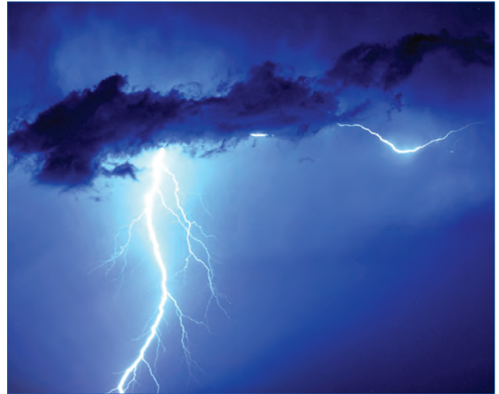
Protection from the Severest Environment