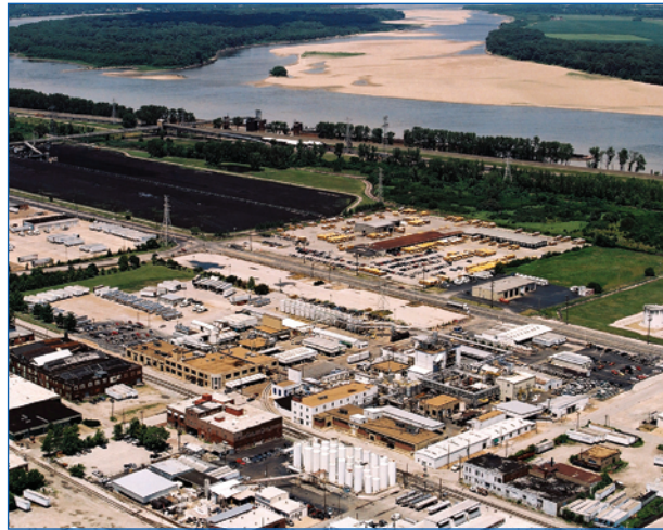
ELANTAS PDG, Inc. headquarters in St. Louis, Missouri

Many ELANTAS PDG, Inc. products are recognized as components of electrical insulation systems in accordance with UL 1446. ELANTAS PDG, Inc. is registered to ISO 9001:2000 and ISO/TS 16949:2002- Second Edition.