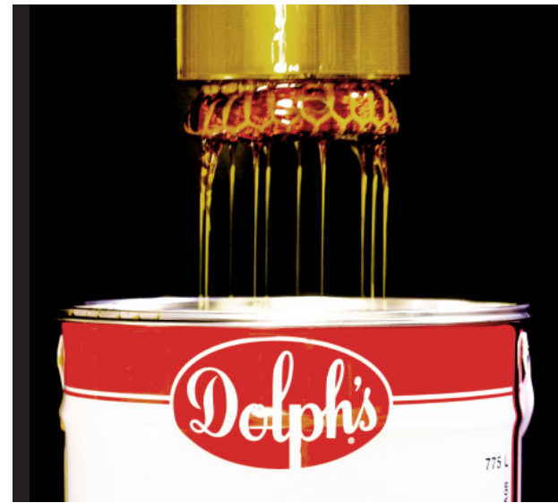
Dipping process for stator impregnation.

Due to hot processes, the resin quality has to be carefully managed. Von Roll has developed and optimized a complete range of resins that combine safety, quality and fast processing.